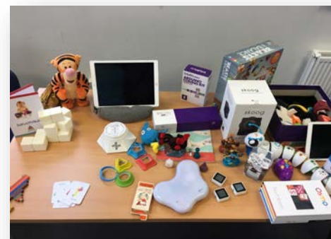
Figure 2: Examples of demonstrations & technology shared