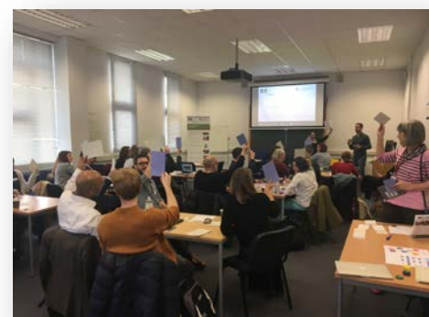
Figure 4: Participants engaged in discussion