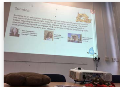
Figure 2: Demonstration of participant profile